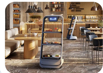
▲ Delivery Robot