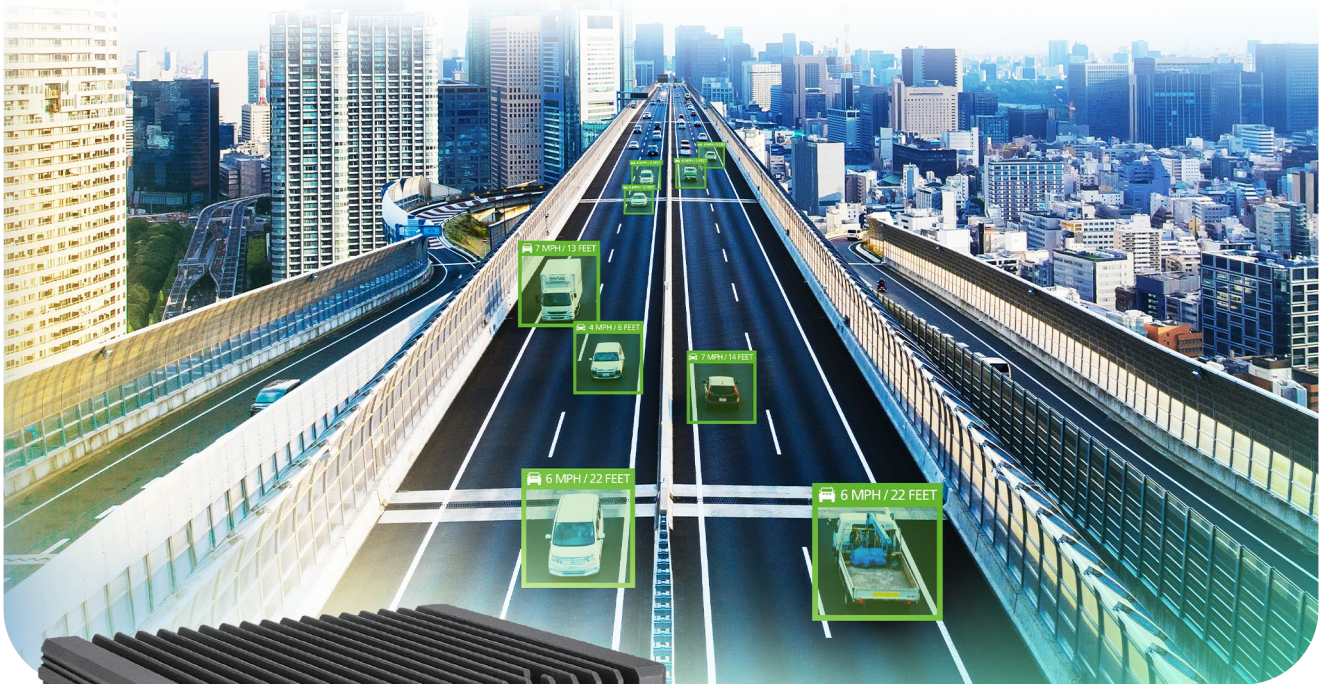
▲ Traffic Vision

NVIDIA® Jetson Orin™ NX/Nano Compact AI Computing System