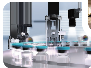
▼ Auto Optical Inspection